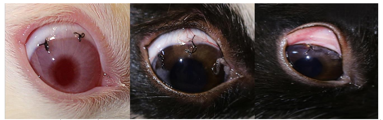
Figure 4: Timolol group: 7<sup>th</sup>, 21<sup>st</sup> and 42<sup>nd</sup> Days of Study; Significant Less Progression of Area and Length of corneal neovascularization (CNV) in 42<sup>nd</sup> Day of Study Compared to the Control and Propranolol Groups.