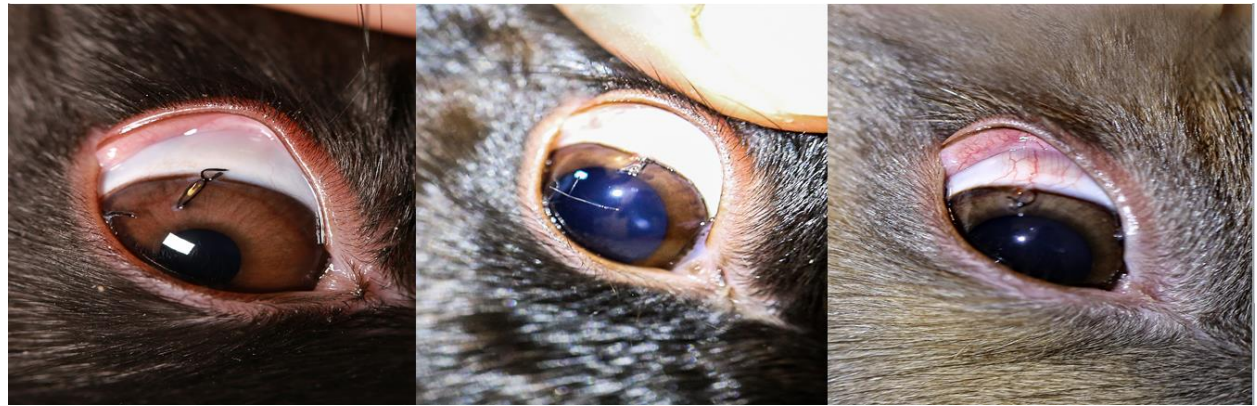
Figure 5: Bevacizumab Group: 7th, 21st and 42<sup>nd</sup> Days of Study; Significant Less Progression of Area and Length of CNV in 42nd Day of Study Compared to Control and Propranolol Groups