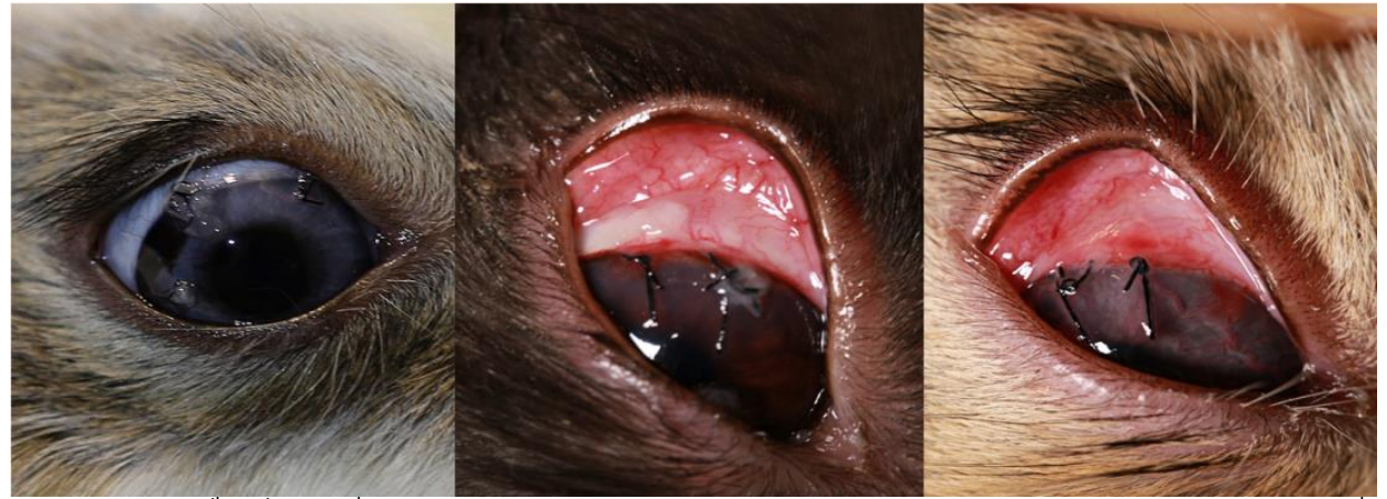
Figure 2: Control Group: 7<sup>th</sup>, 21<sup>st</sup> and 42<sup>nd</sup> Days of Study; Significant Progression of Area and Length of corneal neovascularization (CNV) in 42<sup>nd</sup> Day of Study.