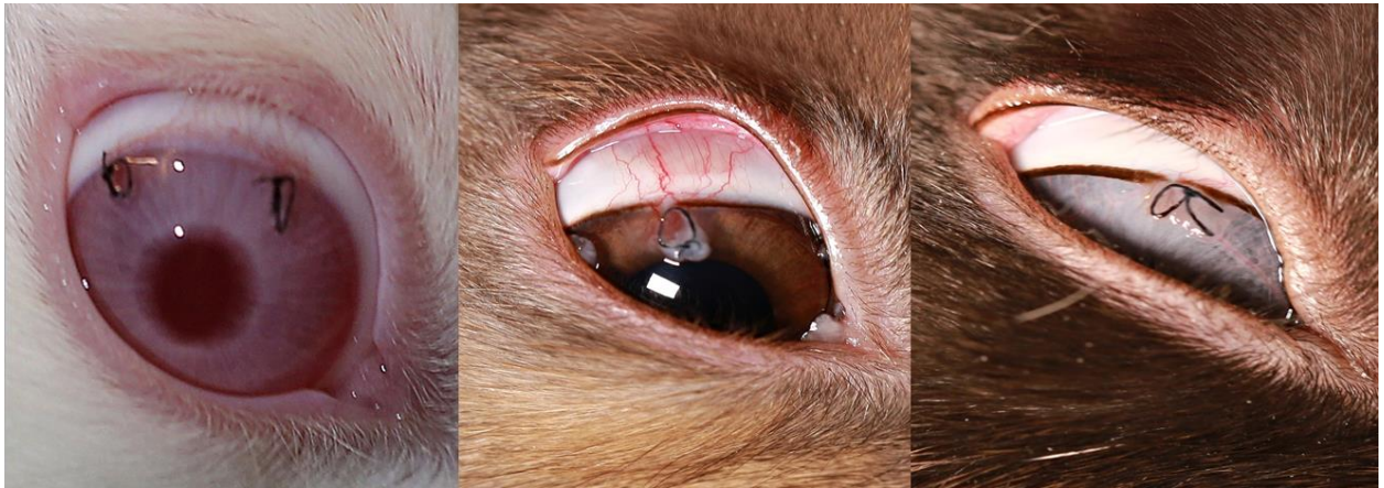
Figure 3: Propranolol Group: 7<sup>th</sup>, 21<sup>st</sup> and 42<sup>nd</sup> Days of Study; Progression of Area and Length of corneal neovascularization (CNV) in 42<sup>nd</sup> Day of Study Compared to the Control Group.