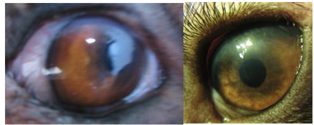
Fig 3. Eyes from group 2 (with omental transposition) at 6 months of follow-up. There is very little or no corneal opacity or vascularization.