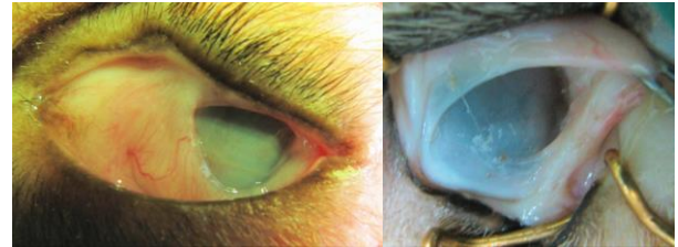
Fig 4. Eyes from Group 1 (without omental transposition) at six months of follow-up. There is severe symblepharon formation, corneal vascularization and opacity.