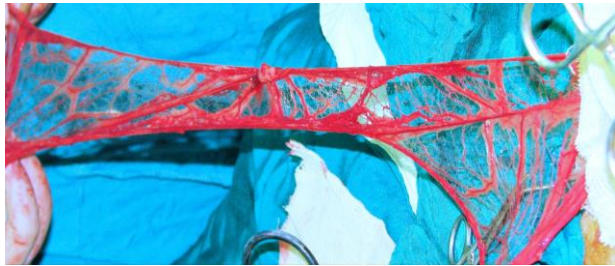
Fig 1. Elongated omentum is prepared and is ready to move to the injured eye.

We designed this experimental study aiming to evaluate the effects of omental transposition on the healing process of an injured eye in an animal model of severe ocular surface alkaline burn.