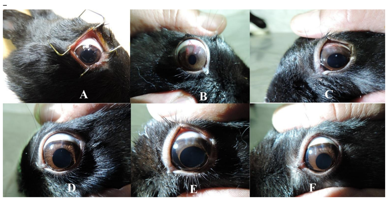
Figure 1: A: Three 7-0 Silk Sutures; B: Corneal Neovascularization prior to Treatment; C: Week 1 in the Saline Group; D: Week 1 in the Timolol Group; E: Week 2 in the Saline Group; E and F: Week 2 in the Timolol Group

Twenty Iranian male rabbits, weighing 1500 to 1900 g, were used in this study. Animals were individually housed in standard cages in rooms at 22 ± 2°C. For adaptation to the new environment, animals were fed for 1 week with pellet food and water as needed. They were used for research and only one eye per animal was tested. The Research Council of Ahwaz Jundishapur University (code IORC-9504) approved this study. Under local anesthesia with tetracaine eye drops (Sinadaro Lab, Tehran, Iran), the right eyes of all rabbits were prepared as follows.