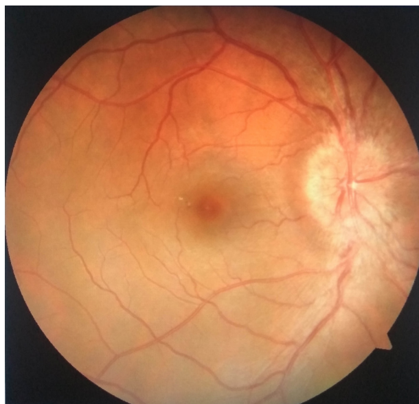
Figure 1. Fundus photo (TOPCON TRC-50 DX, Japan) of the right eye showing diffuse optic disc edema without peripapillary or disc hemorrhages. Note the indistinct optic disc borders and edema of the peripapillary nerve fiber layer.

Standard automated perimetry was performed. A grayscale display of the standard Humphrey program 30-2 visual field (Carl Zeiss Meditec, Inc., Germany) revealed an enlarged blind spot in the right eye, as shown in Figure 2, which corresponded to the optic disc edema. The visual field of the left eye was within normal limits.